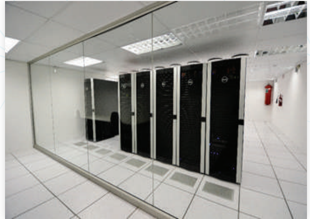
Above: FirstNet's Umhlanga DC where we collocated IFS hardware before migrating

"The technological benefits of outsourcing our IT to FirstNet has allowed IFS Africa to be more agile as a business. With FirstNet's support and professionalism, we have a valuable and responsive partner that take a proactive approach to ensuring our changing needs are met. This partnership allows us to transform the future of our business tactically and dynamically."